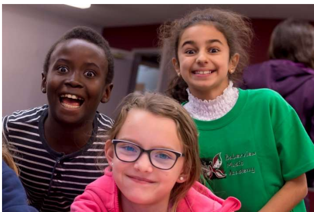
BMA students having fun during snack 2019-2020