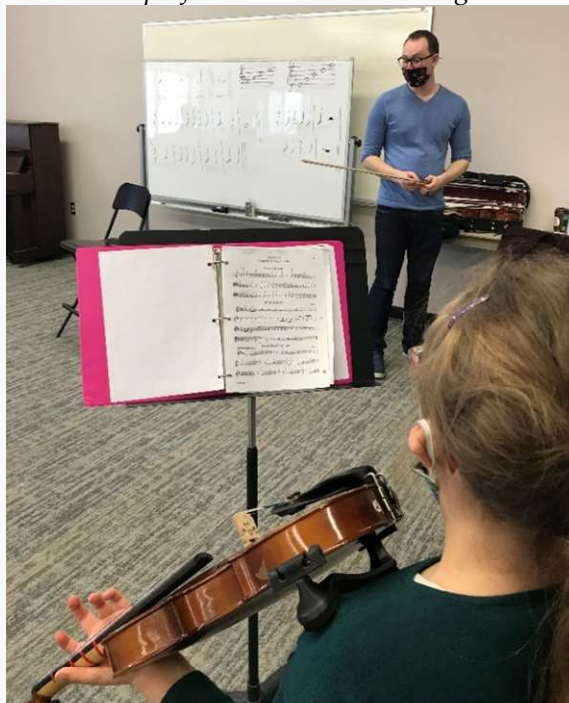
BMA hires professional music teaching artists